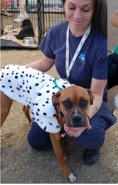
FUN TIME AT THE FAIR — These photos are from our fun during the 2014 Datefest.

{f If} this year's Riverside County Fair and National Date Festival is anything like last year's event, the county's animal shelters are going to see empty kennel runs. And that's exactly the result everyone is hoping for when the county fair kicks off on Friday, Feb. 13. Riverside County Animal Services placed almost 200 dogs in loving homes during the fair's two-week run, surprising everyone's expectations. The $20 special adoption rate played a major role in the high number of adoptions. Also, adopters were allowed to leave their pet in the holding area to enjoy the fair all day long before they headed home with their pet. The county will once again offer the dogs for the special rate of $20 — which includes the pet's spay or neuter surgery, a microchip and vaccinations. A dog license fee of $16 will apply if the adopter lives in Riverside County's service areas. Keep a watch on our Facebook page for a sneak preview of the dogs making the trek.