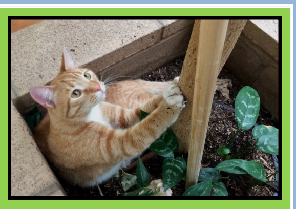
Please go to page 4 for Kevin's story.

Kevin the Cat: Travelin' Tabby Flies Home to South Carolina