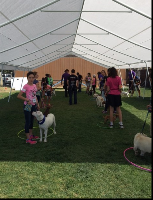
Our spring camp, "Dog Olympics," was once again a huge hit with children and pets alike. The kids worked daily with dogs to teach them how to do agility events, such as running through tubes, up ramps and leaping through hoops. There was also great bonding with the homeless dogs. Ultimately, all the efforts by the children provided great enrichment for the shelter dogs. After the week-long camp ended on April 3, several of the dogs traveled to the OC Pet Expo and were adopted. In fact, every dog that was used in the camp has since been adopted. Yay! If you have children interested in working with animals, our summer camp runs July 13-17 and July 20-24.