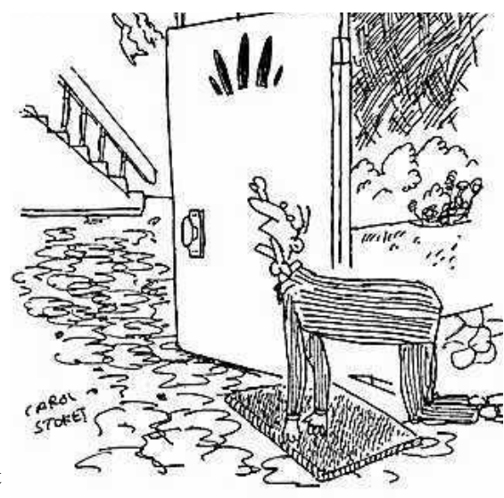
"I'm home - I've worked like a dog today."

In short a tired dog is a good dog. Regular exercise and play time with mans best friend never hurt anyone.