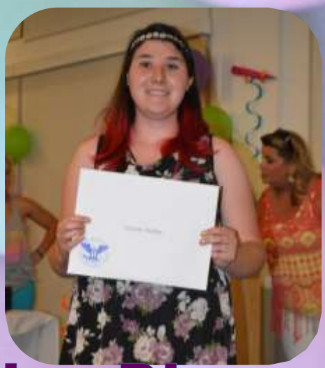
Volunteer Appreciation Dinner