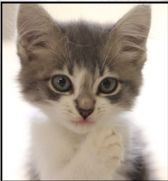
Young kitten, Mellow, caught grooming himself...