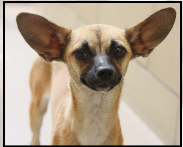
Little Vernie posing for the camera...