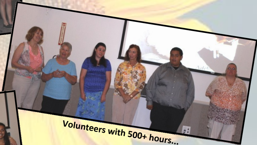
Volunteers with 500+ hours...