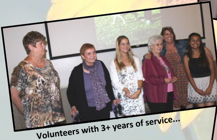
Volunteers with 3+ years of service...