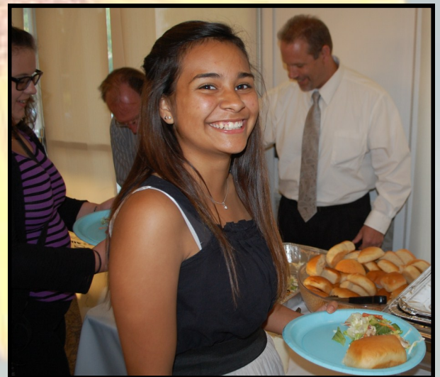
Excited to eat!