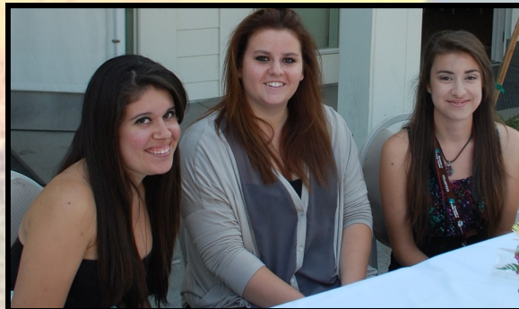
The welcoming crew...