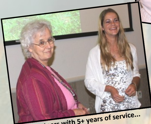
Volunteers with 5+ years of service...