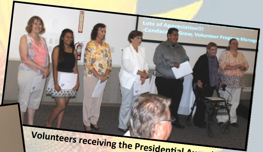
Volunteers receiving the Presidential Award...