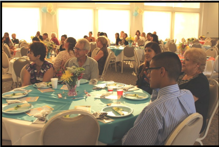
Volunteers watching a slideshow presentation...