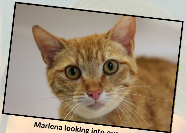
Marlena looking into our camera...