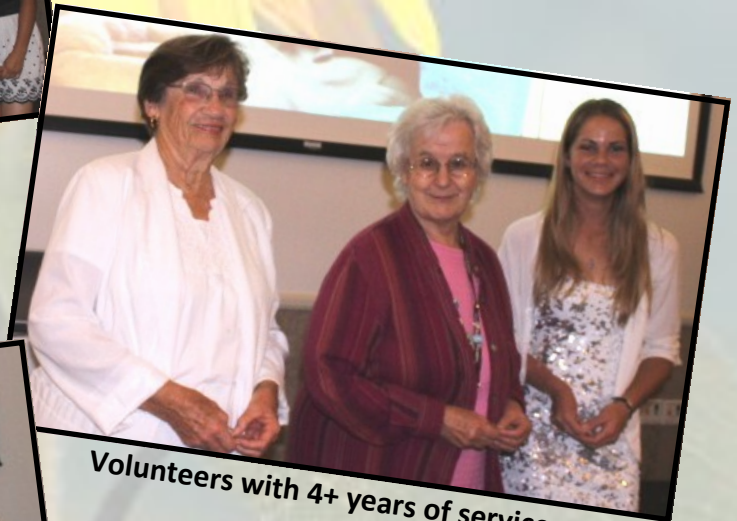
Volunteers with 4+ years of service...