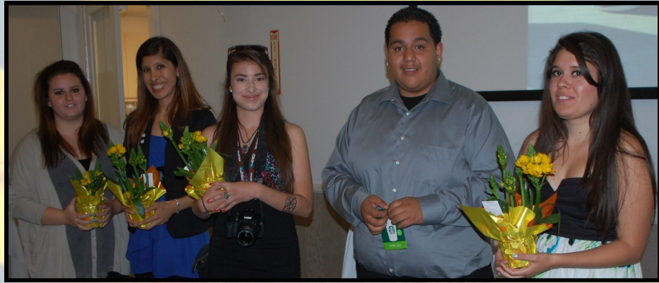
The Volunteer Committee...