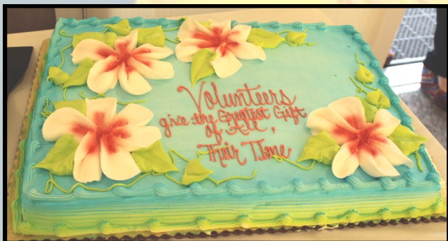
Volunteers give the greatest gift of all... their time!