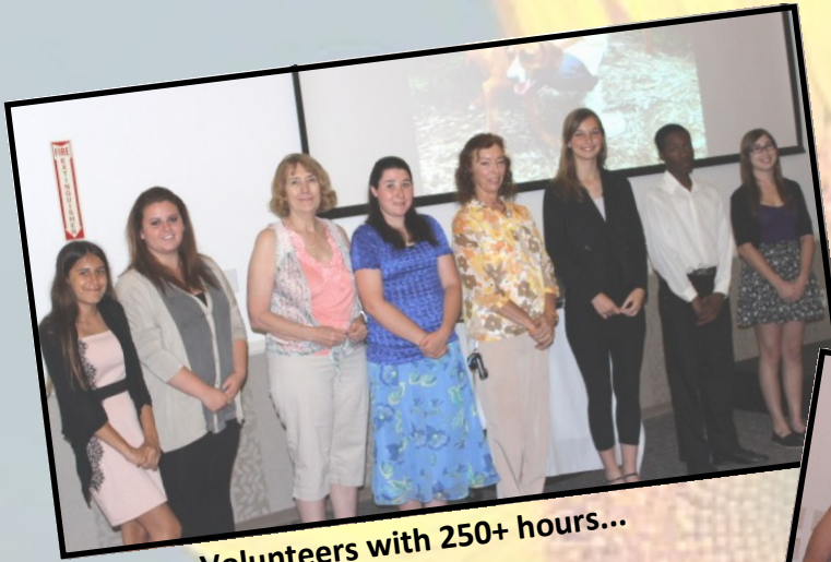
Volunteers with 250+ hours...