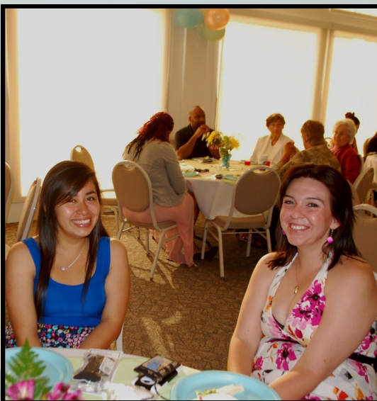
Having a good time...