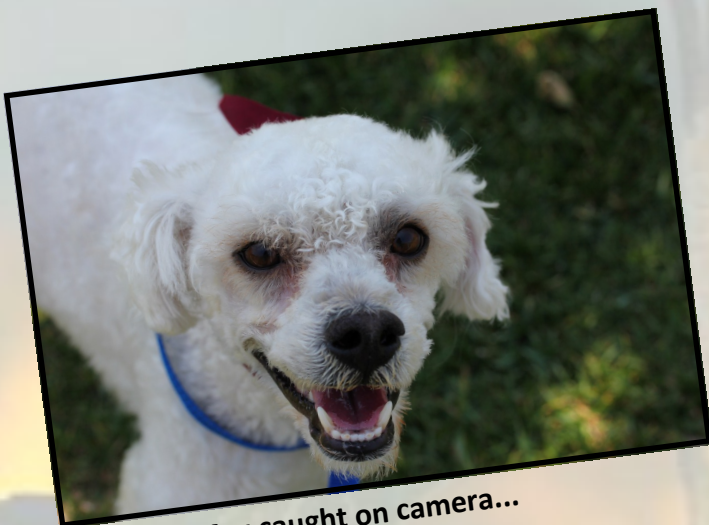
Max caught on camera...