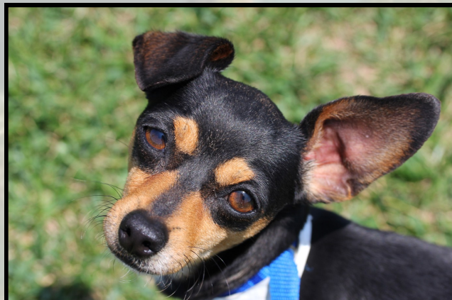
Little Haydies posing for the camera...

Congratulations to all of our Volunteers for placing pets in forever homes and thank you for all of your hard work here at the shelter!