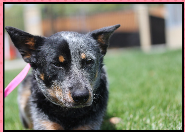
Cute dog posing for the camera...