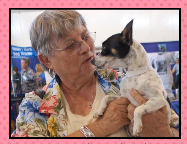
Pet Expo Pet being adopted...