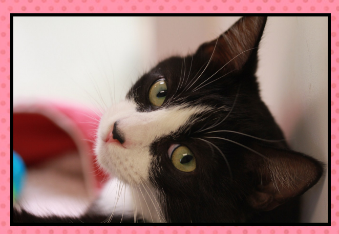
A cat caught on camera...