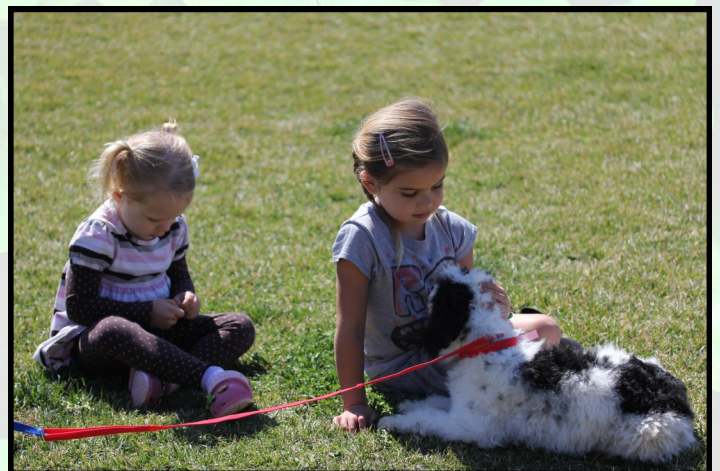
Here is our freshly groomed dog and his new family!

And the best part of this story? He was adopted within a few minutes of being brought back in his kennel! This adorable dog opened up and his personality had made a family fall in love with him!