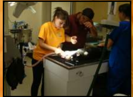
Helping out in the clinic