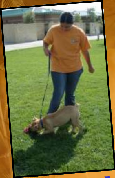
Taking a dog for a walk