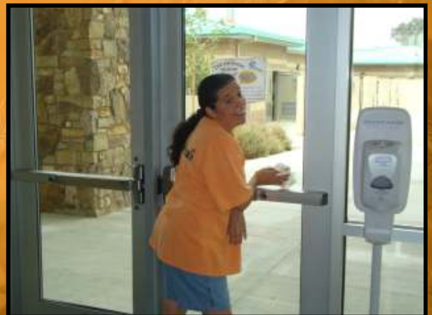
Keeping the shelter clean

To see more picture of volunteers in action visit our face book page at or websites rcdas.org