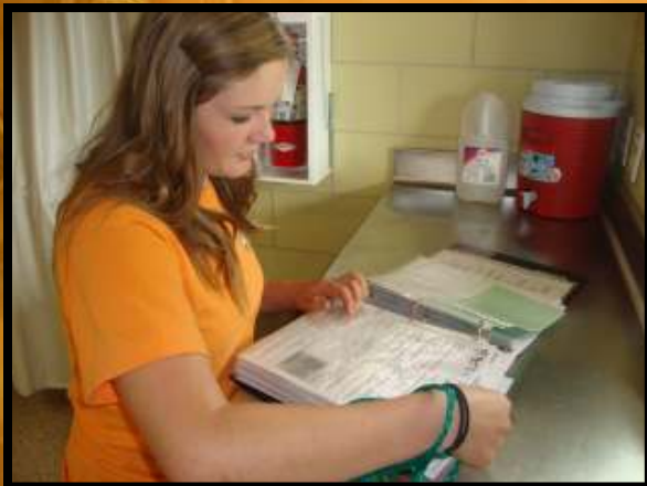
Making sure every dog has his card