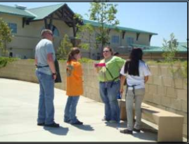
Training New Volunteers