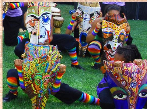
Drum Mask and Dance Festival